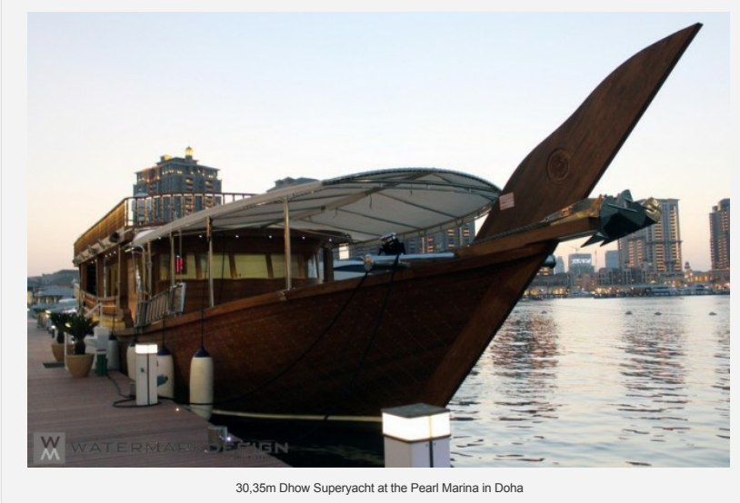
The yachts can comfortably sleep between 8 and 10 guests in 4 or 5 luxurious cabins, depending on the interior