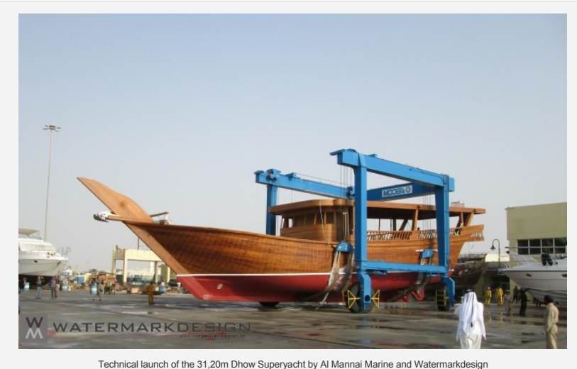
Two superyachts, measuring 30,35m and 31,20m in length, have already hit the water at the Al Mannai Marine shipyard, with a 33,20-metre superyacht presently in build. Her interiors have already been built in Italy, with the